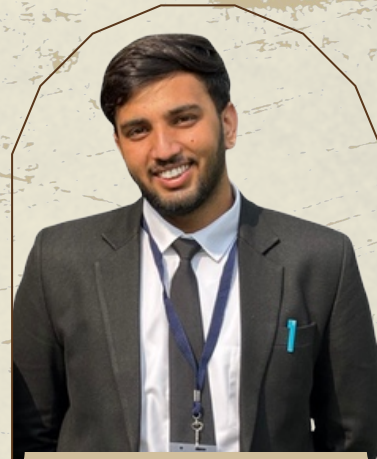
DEV Secretary General